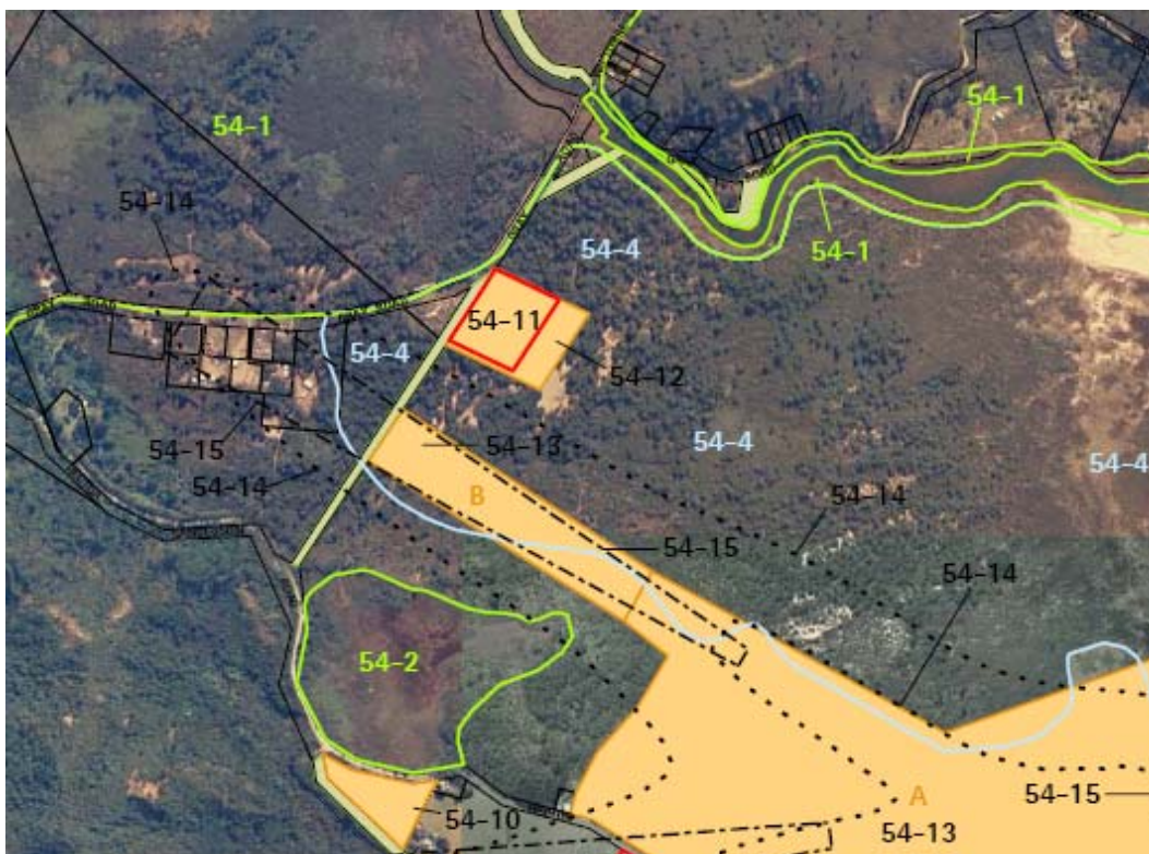
Extract from Map 54 – sheet 2